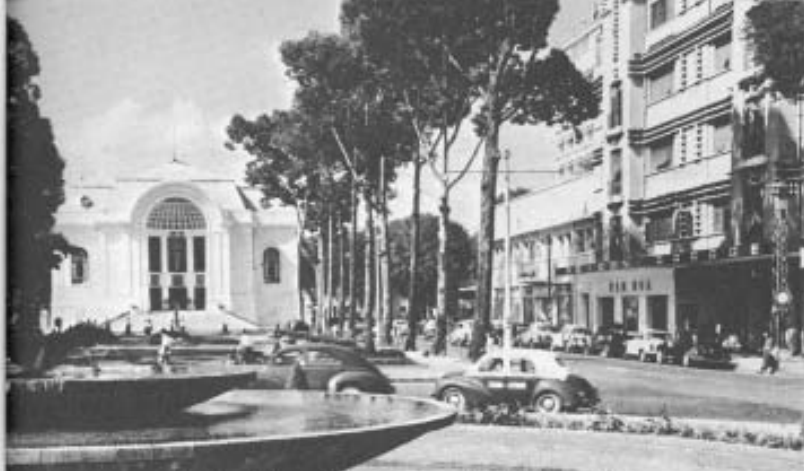
National Assembly meets in white building (left).

Saigon is the capital and largest city of Vietnam. With its predominantly Chinese city of Cholon (meaning "big market"), it lies