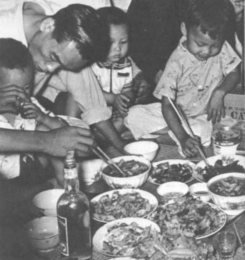
Vietnamese food delights both eye and palate.

nut." Among the vegetables are common ones like potatoes, turnips, carrots, onions, and beans; eggplant disguised under the name aubergine , and water bindweed, an herb that comes from the same family as our morning-glory flower.