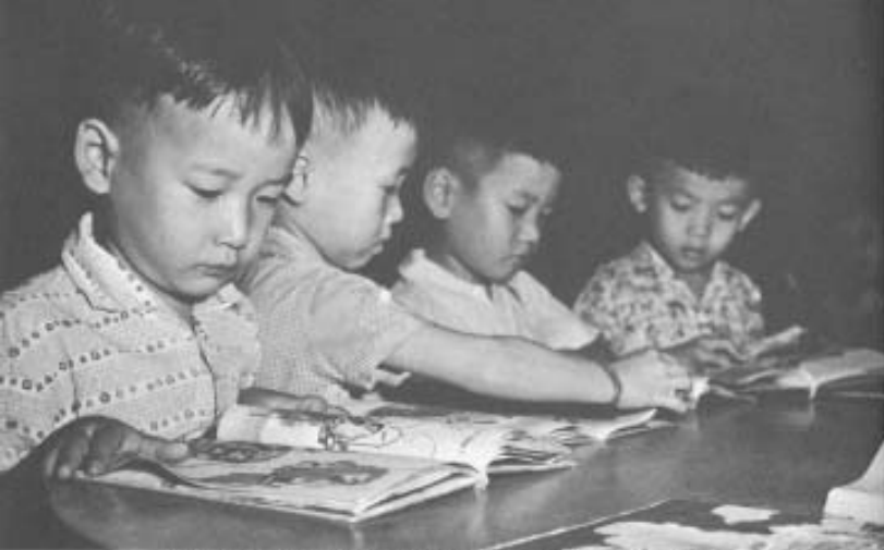
Schoolbooks capture the attention of young students.